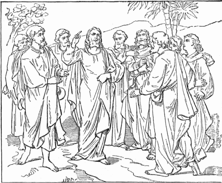
Disciples of Jesus

Are we Christians or do we take following Christ seriously and are disciples?